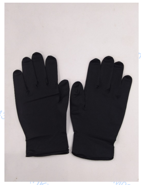
Samples described as Fishscale Powder Free Nitrile 6 mil 240 mm Black